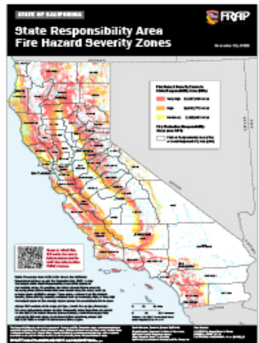
Figure 22: Example of the Fire Hazard Severity Zone Map for California. More details can be found at: https://osfm.fire.ca.gov/what-we-do/community-wildfire-preparedness-and-mitigation/fire-hazard-severity-zones