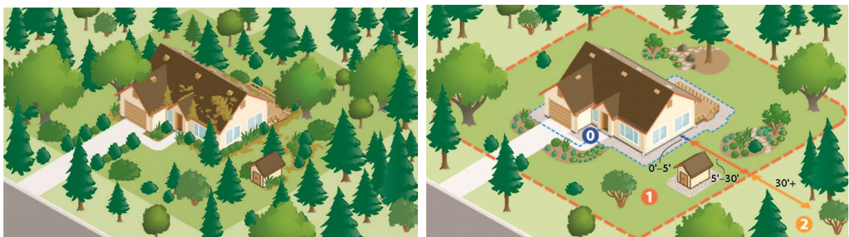
Figure 2: This is an illustrative example of the defensible space actions taken before and after using the three defensible space zones. Zone 0 applies to all structures. In the after instance (on the right), the pathways for fire to travel have been disconnected between planting groups or islands of landscaping. Additionally, the lower branches of trees have been removed to prevent fire from traveling through the treetops. Zone 0 actions eliminate the potential for embers to ignite combustibles adjacent to the structure.

Currently California regulations provide for a two-zone defensible space system. Zone 1 is within 30 feet of the home or building and was established in 1965. Zone 2 was added in 2006 and extends outward from 30-100 feet of the home or building, or to the edge of the property if there is less than 100 feet. These traditional zones are important for reducing home ignition from direct flame contact and providing a safe place for fire crews to locate. Fire data shows, however, that these zones have been repeatedly compromised by wind-distributed embers, leaving structures and homes at risk of ignition.